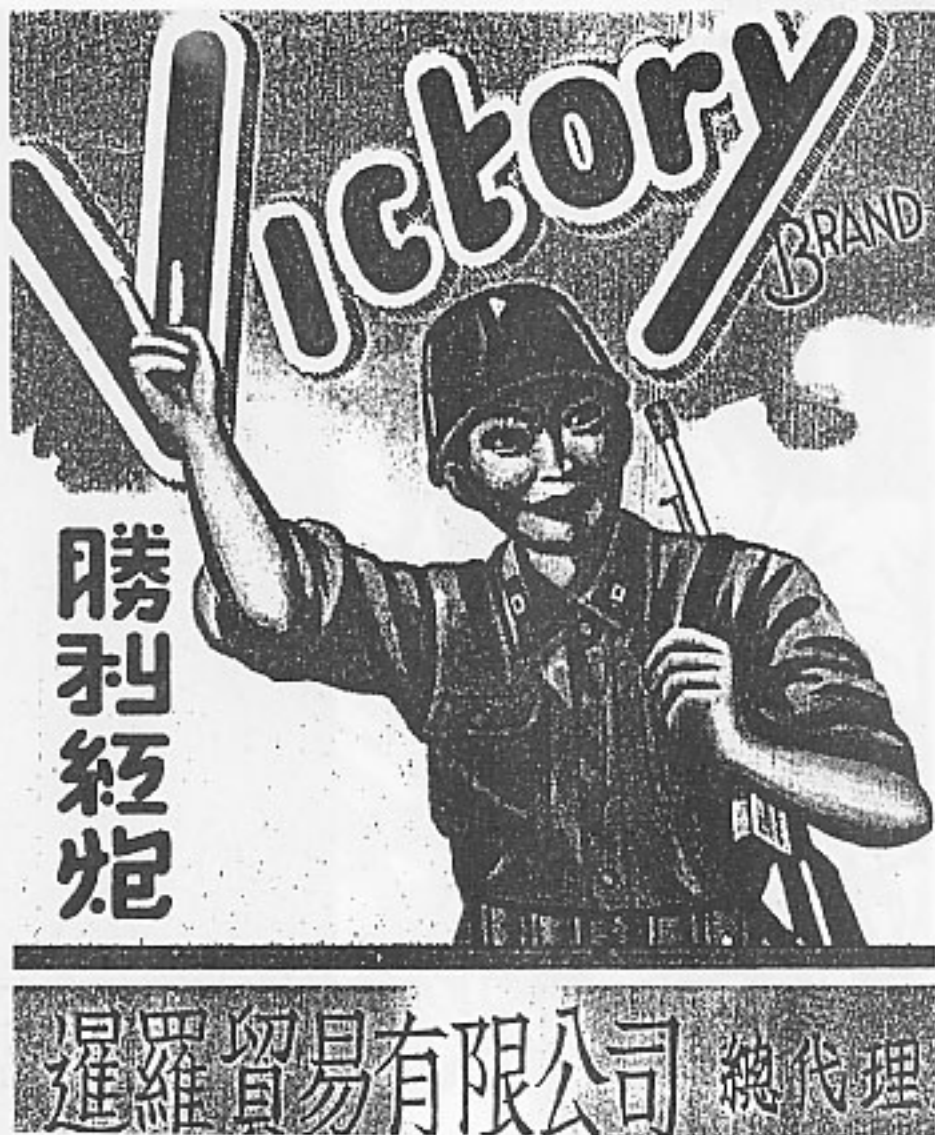
'Untitled' detail from video installation

The line between direction and intention becomes blurred when one begins to realise that the video screen is not enough. Attempts are then made to resonate the content of the video against images and objects outside of the screen and therefore the video is no longer just played back but 'installed'. An image for a catalogue cannot encompass a whole installation, which is yet to be constructed but only works as a single element, removed from the effect it has as part of a larger structure. The catalogue entry is, in fact, another extension of the video screen.