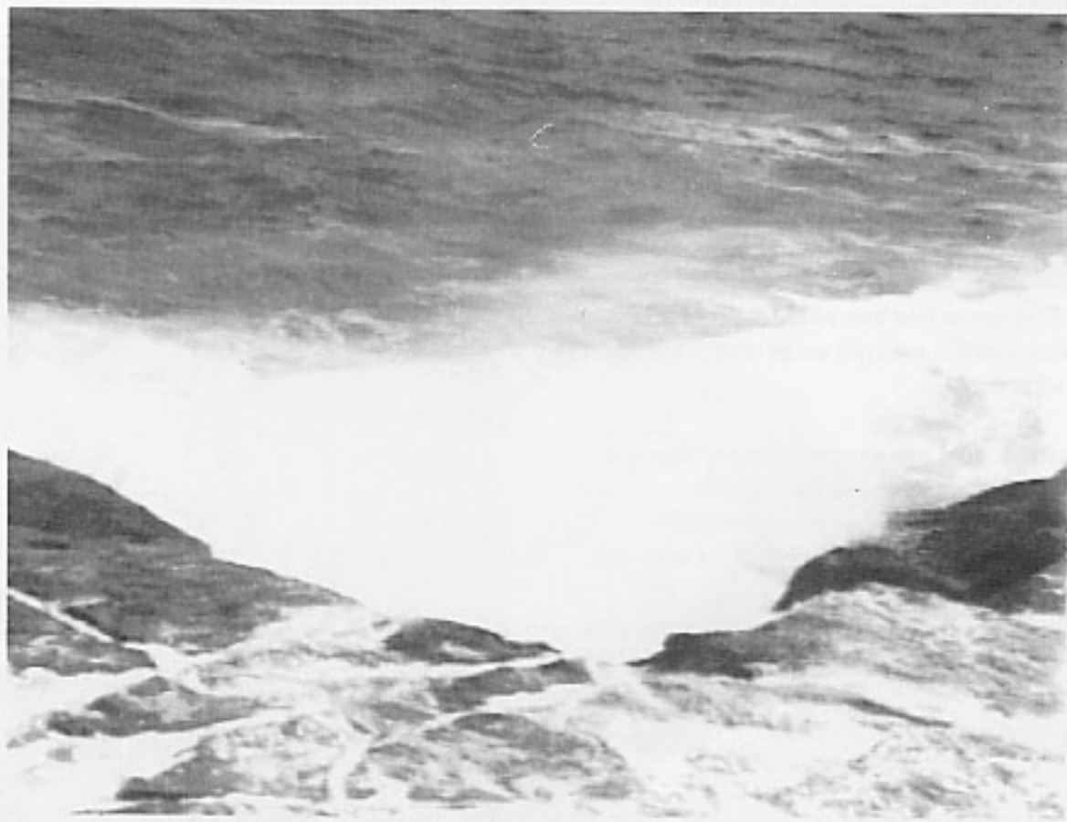
'Fifteen Plus' still from video installation